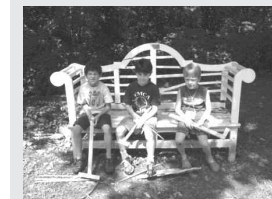
Three happy campers at July's Seeds Weeds, and History Camp.