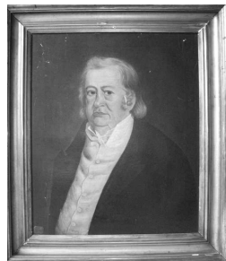
LHHS's portrait of Kentucky's third Governor, James Garrard

I invite all of you to come and take a tour of Liberty Hall and make plenty of time to see our temporary summer exhibit located in the dining room of the Orlando Brown House titled "Tea Time: Selections of tea cups, kettles, and sets from the Liberty Hall Collection." This exhibit was created to go along with Euphemia's Tea Party which took place in June. The objects on display are pieces that are typically in storage. This is a great opportunity for you to see some of the collection that is not usually featured on the tour! This exhibit is scheduled to end on Saturday, September 19.