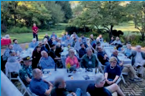
An Evening by the River: History of the Kentucky Reel

Storybook Trail Liberty Hall Tree Walk Archeology of Ancient Gardens in Kentucky Creating Floral Arrangements from Your Own Garden Family Garden Tours Drawn & Painted from Life Botanical Watercolor History of Herbariums and Creating Plant Specimens Nature Journal Club