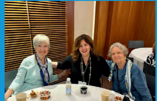
Kentucky Culture Symposium