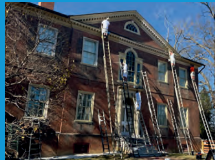
Exterior Paint refreshed for both Liberty Hall and the Orlando Brown House